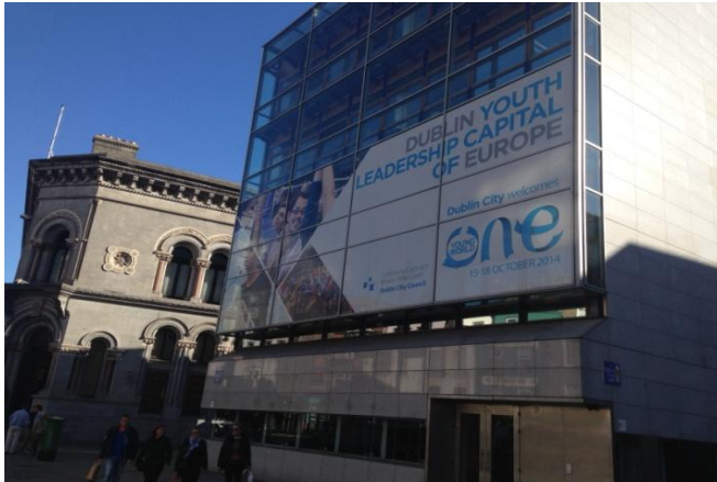
Branding on 3 Palace Street

This office facilitated meetings with the Lord Mayor as well as giving briefings on Dublin to delegations from several countries attending the One Young World Summit. This included a delegation led by the Mayor of Albufeira, Portugal and the Governor of Bangkok, Thailand